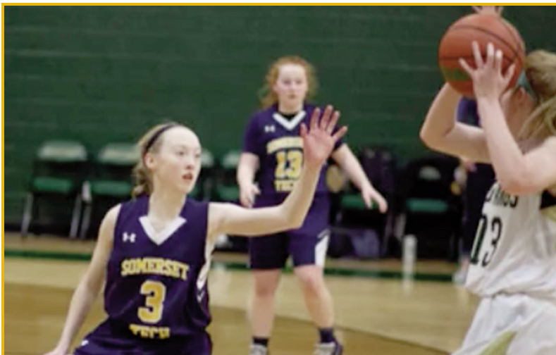
Excerpt from the video coaches made to commemorate the SCVTHS Girls Basketball Team's current season

Coach O'Reilly added, "Most of the girls were speechless when we arrived outside their home and many asked how we found out where they lived, but all were very thankful and